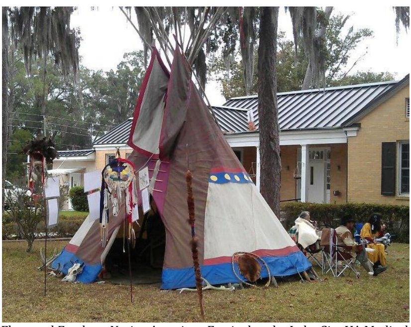
Nov. 2012 Flags and Feathers Native American Festival at the Lake City VA Medical Center